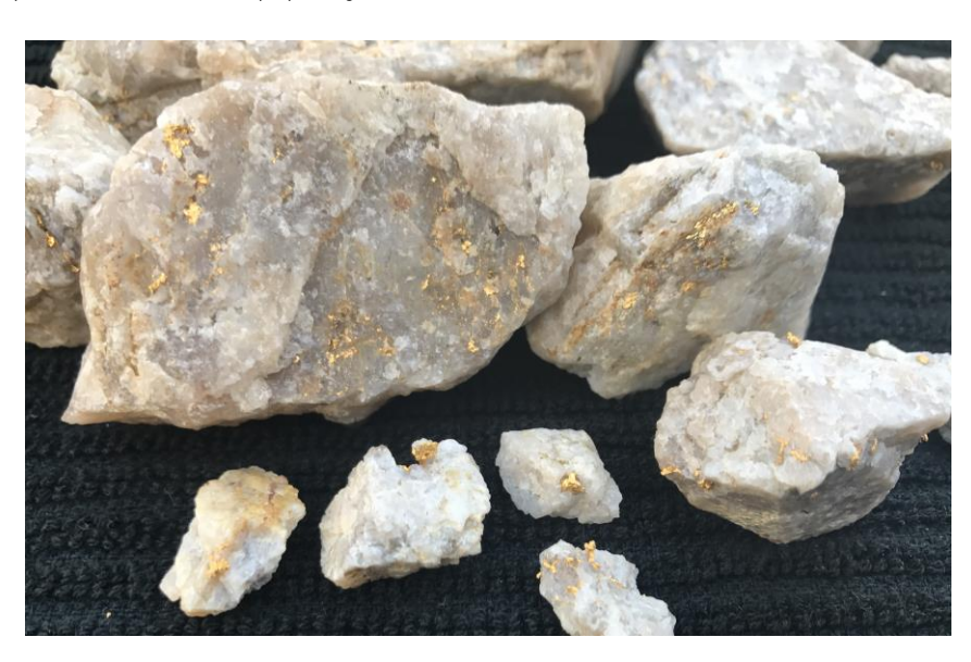
Figure 3: Example of visible gold in rock samples taken from around the Lady Ada deposit (see announcement dated 12 Sept 2017)